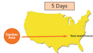
Sager Sudden Link and World Direct Shipping

For example, product with a 3-day manufacturing lead time – here is the difference: