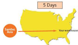
Sager Sudden Link and World Direct Shipping

For example, product with a 3-day manufacturing lead time – here is the difference: